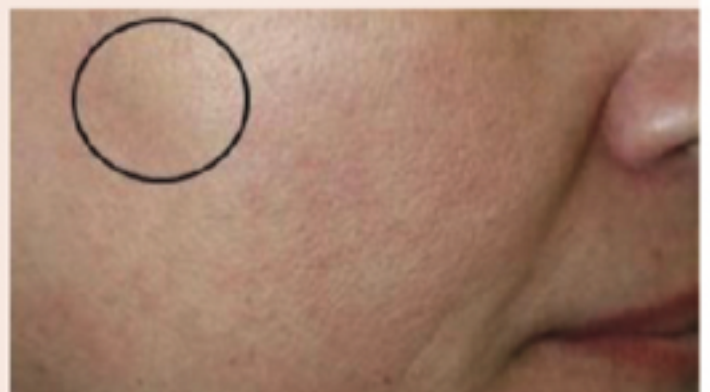
Μετά από 5 συνεδρίες