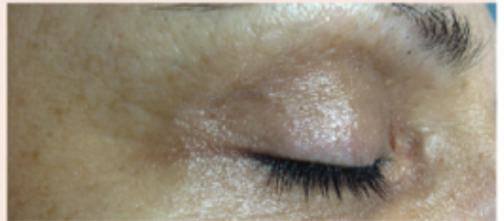
Μετά από 1 συνεδρία