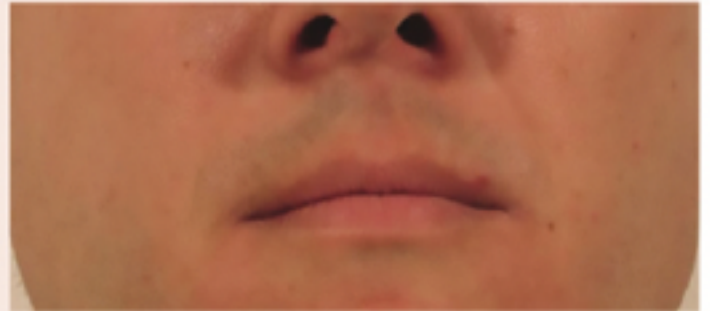
Μετά από 7 συνεδρίες